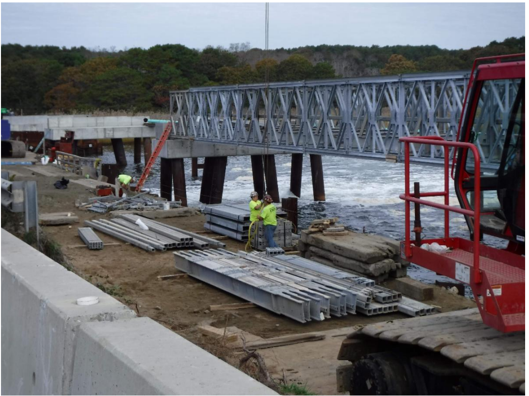
Temporary bridge span installed between bridge piers